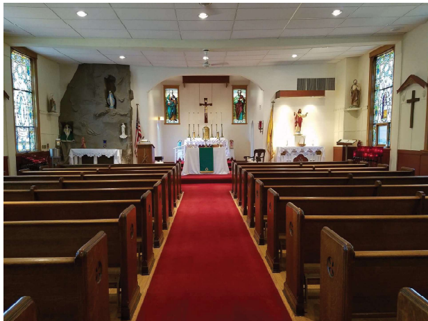
Sacred Heart, 2019