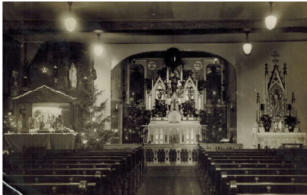
Christmas at Sacred Heart, after the church's first interior simplification; photo taken some time between 1938 and 1941.