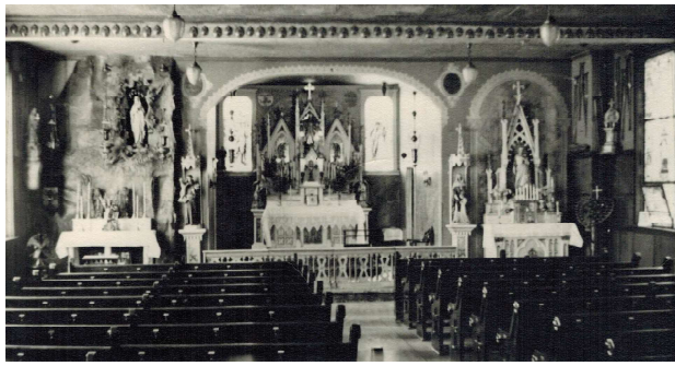
The church was adorned with crutches (upper right corner of photo) and thanksgiving medallions (along the ceiling beams), testifying to the cures attributed to Rev. deNorus. Photo taken prior to 1935.