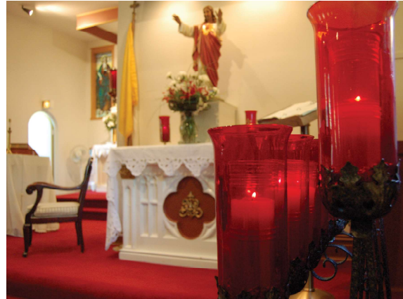
Sacred Heart Adoration altar, 2019