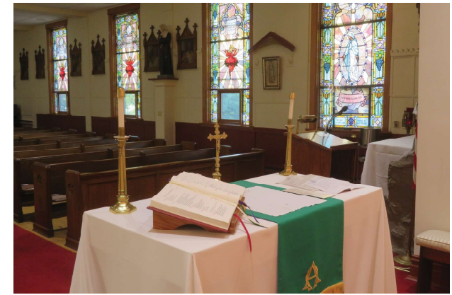
Sacred Heart, 2019