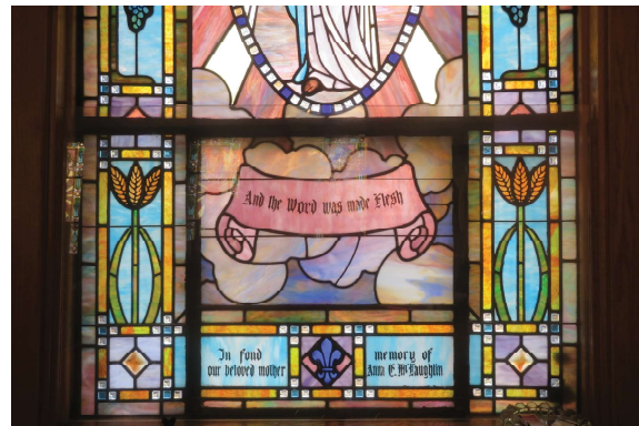
Stained glass detail, 2019